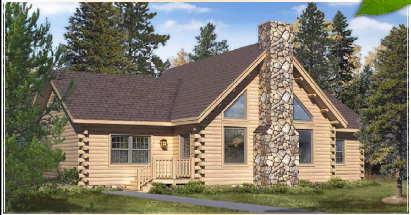
BROOKSIDE 11, c1, c9