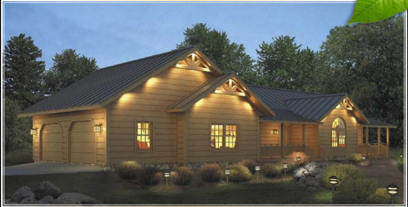
LOYALHANNA fp2, l3, r1